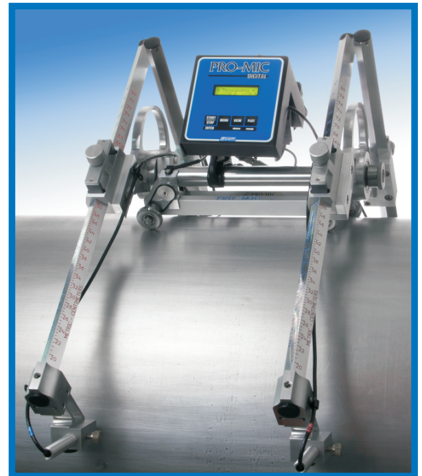
8" to 32" PRO-MIC TRUE End-to-End X-Caliper Design

Call us, or call any one of the more than 950 satisfied PRO-MIC users. Any of us would be happy to talk with you about our Systems.