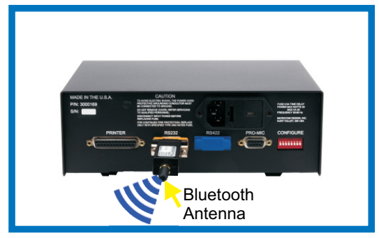
PRO-MIC Bluetooth Wireless Charger/Interface

Please contact PRO-MIC at 1-800-PRO-MIC-1 or info@pro-mic.com with any questions.