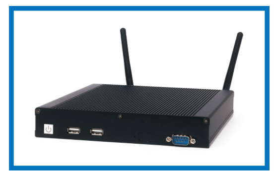
PRO-MIC PDL Desktop Fanless Workstation (See TN-054) Harsh Environment PC Built by PRO-MIC

PRO-MIC Corporation . 20135 Valley Forge Circle . King of Prussia, PA 19406