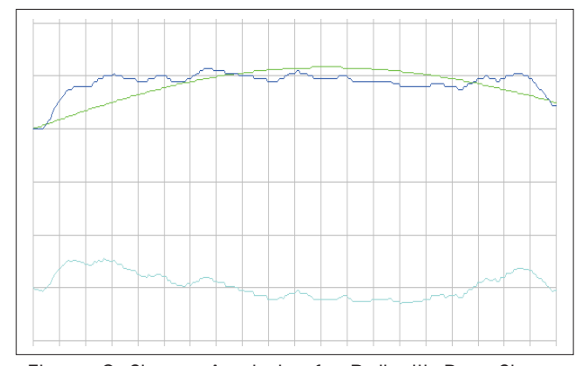
Figure 2: Shape Analysis of a Roll with Poor Shape