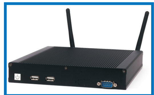
PRO-MIC PDL Desktop Fanless Workstation (See TN-054) Harsh Environment PC Built by PRO-MIC