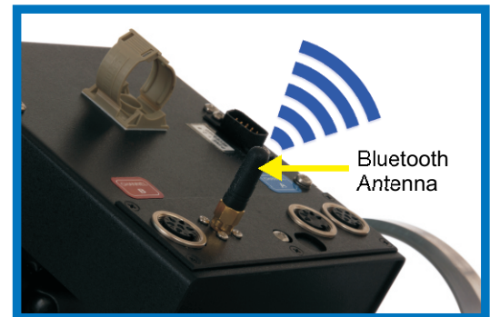
PRO-MIC Digital Electronics with Bluetooth

Please contact PRO-MIC at 1-800-PRO-MIC-1 or info@pro-mic.com with any questions.